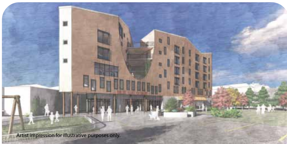
Artist impression for illustrative purposes only.

We know that affordable housing and access to support programs play a key role in keeping our entire community healthy and safe. Help us build a stronger, safer Coast for all.