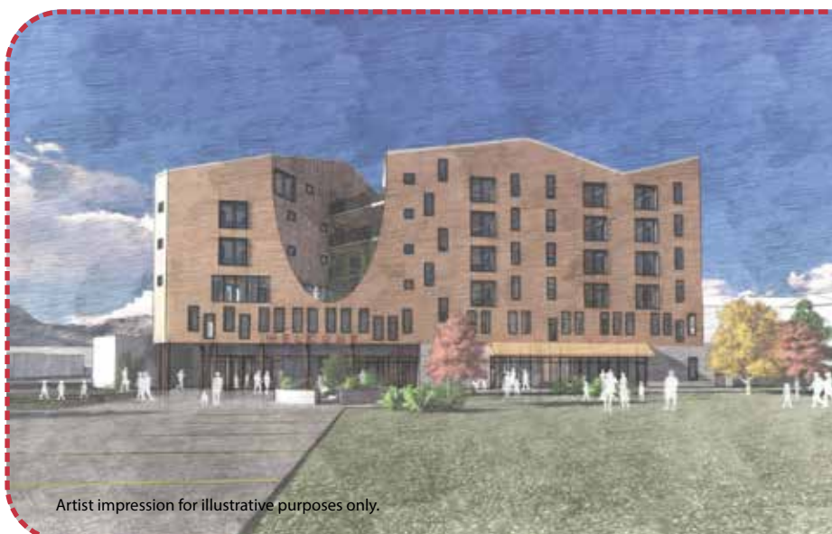
Artist impression for illustrative purposes only.

This development will be built on land in downtown Sechelt that we already own and on which we already provide a wide variety of community services. With our thoughtful design and community-centric approach, we will revitalize the neighbourhood at the end of Inlet Avenue into a safe and welcoming space for all.