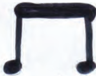
Singing + Dancing